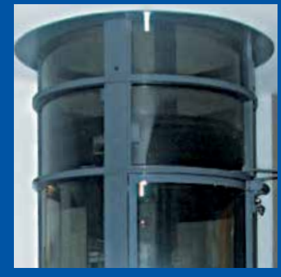
Blueish gray Color RAL 7024