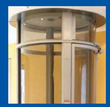
Aluminium Color RAL 9006