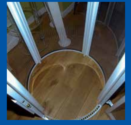
Non fumed polycarbonate